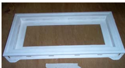
08K637 WHITE RANGE HOOD BACKER 08H016 LIGHT ALMOND RANGE HOOD BACKER