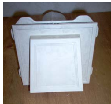
08K725 WHITE DRYER VENT 08H017 LIGHT ALMOND DRYER VENT (THROUGH THE SIDING)